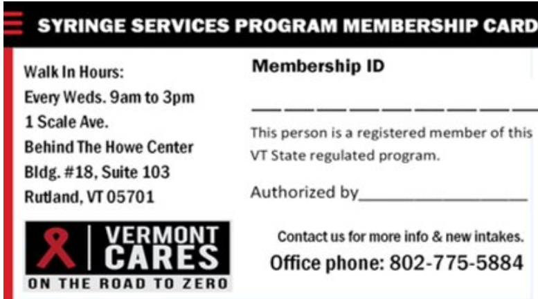
Front of Card

Member cards offer protections under Vermont state law.