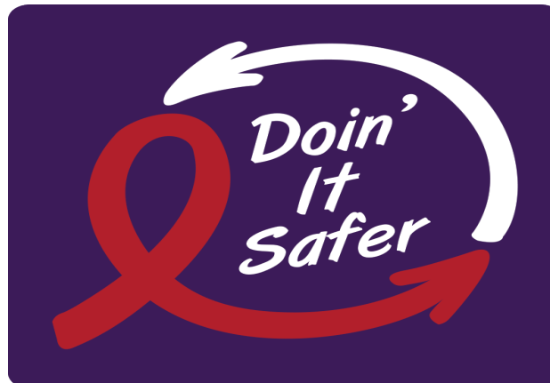
Back of Card

If you are a law enforcement agent and have questions or concerns please contact us at the number on the front. Please do not confiscate syringes of registered members.